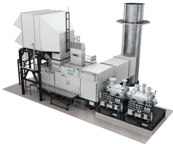
(Above): Siemens SGT-700 mechanical drive gas turbine driving two STC-SV centrifugal compressors.

This press release and press pictures are available at