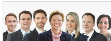
Your Siemens IR Team