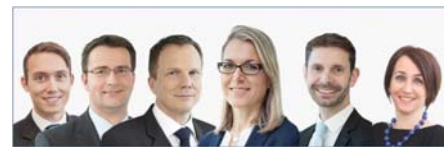
Your Siemens IR Team