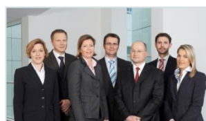
Your Siemens IR Team