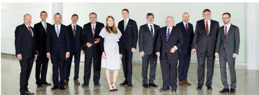
Inventors of the year 2016: Ten researchers with 558 inventions

Siemens has also improved in the area of patents. As of September 30, 2016, the company's continuing operations held some 59,800 patents worldwide. At the end of fiscal 2015, the figure was 56,200. In fiscal 2016, Siemens employees submitted about 7,500 invention disclosures – an average of about 30 per workday. The number of R&D employees at the company averaged 33,000 in fiscal 2016 – about 800 more than in the previous year.